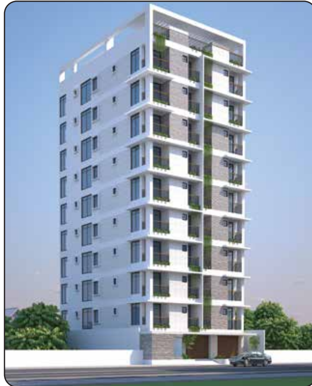
RIMJHIM Savar DOHS, Dhaka